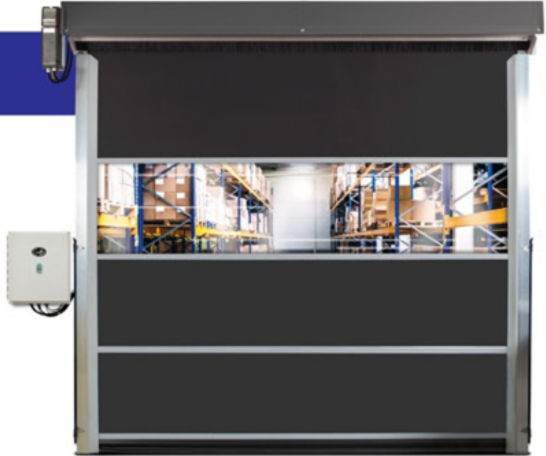
10' x 10' door pictured with black & vision panels