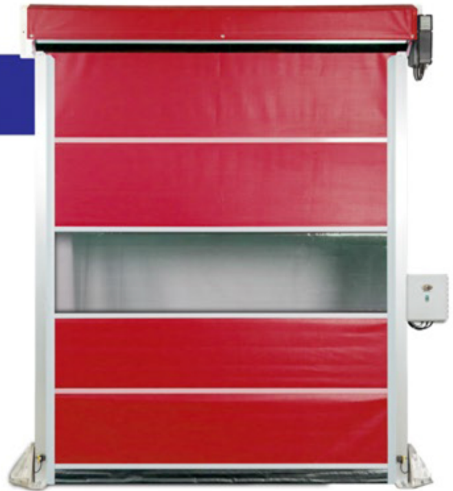
8' x 10' door pictured with red & vision panel in Door Support Frame