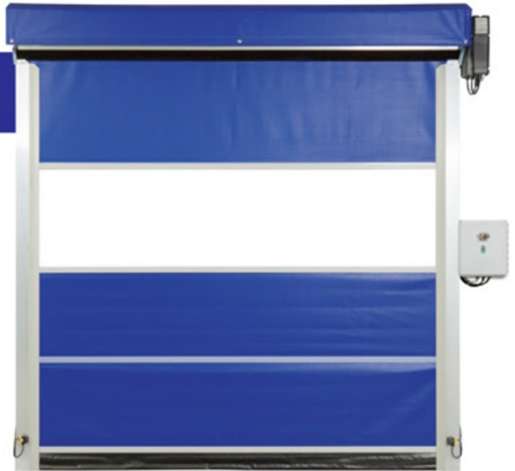
10' x 10' door pictured with blue & vision panel in Door Support Frame