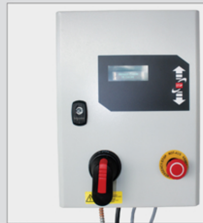
NEMA 4X Smart Start™ NXT control box

The Speed-Master® 1600 XL now includes our Smart Start™ NXT, next generation, NEMA 4X, control box as standard. The updated control box has a simplified wiring configuration, is more powerful, and has fewer components and cables as compared to the original Smart Start™. A distribution block accepts the activation and protection device wiring; main power cables feed through pre-drilled holes on the bottom of the box where the individual wires, with pre-wired removable terminal blocks, simply plug into the circuit board. There are extra ports on the control board allowing for firmware upgrades and future expansion. A USB port is available for maintenance monitoring.