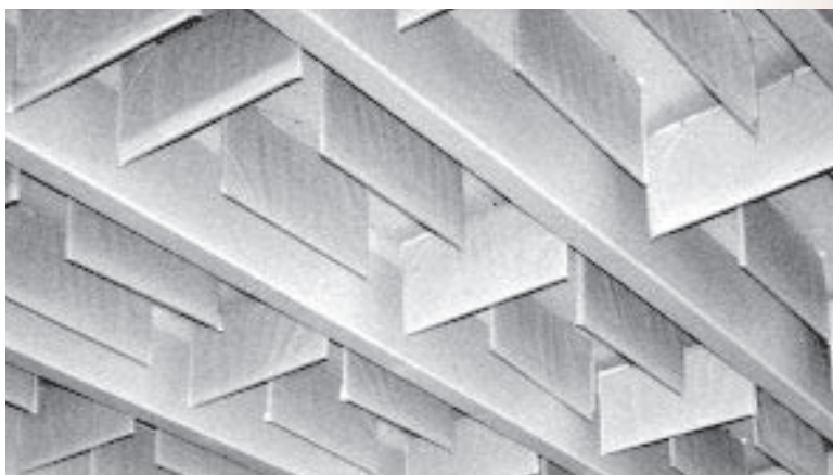
Ultra Baffles installed in the bays of a concrete ceiling reduce reverberation throughout the facility.